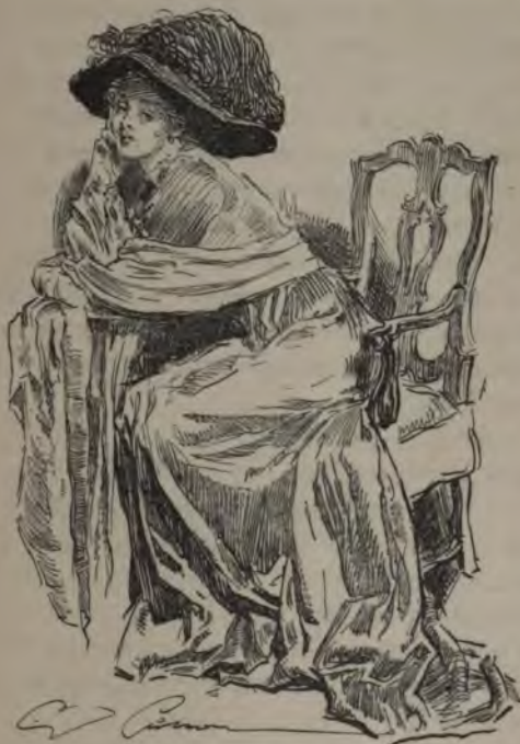
The Countess d'Enver.

A little later they were seated at a small table together, sipping chocolate. There was cold meat, a